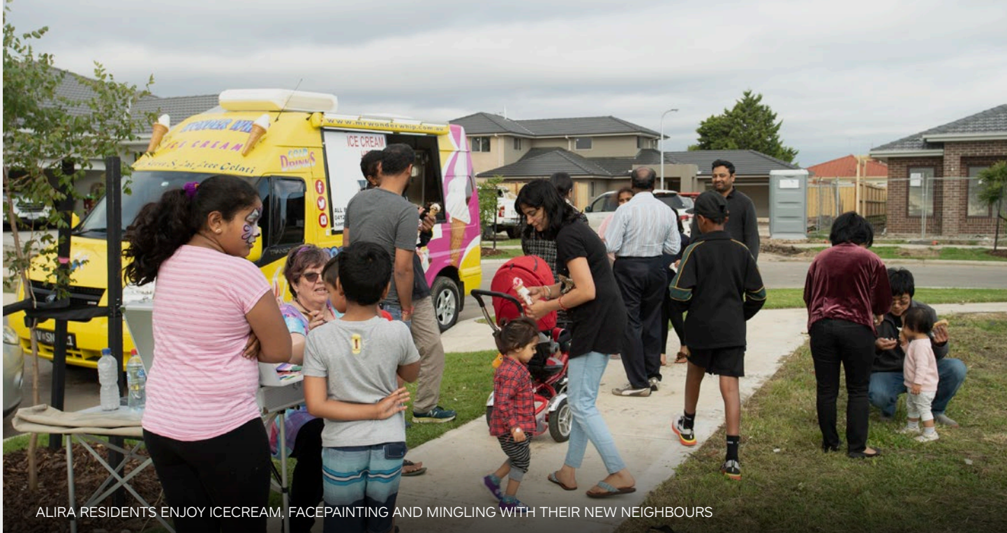
ALIRA RESIDENTS ENJOY ICECREAM, FACEPAINTING AND MINGLING WITH THEIR NEW NEIGHBOURS

As another year comes to an end, it's time to enjoy balmy nights, cotton candy skies and make the most of the holiday season at Berwick.