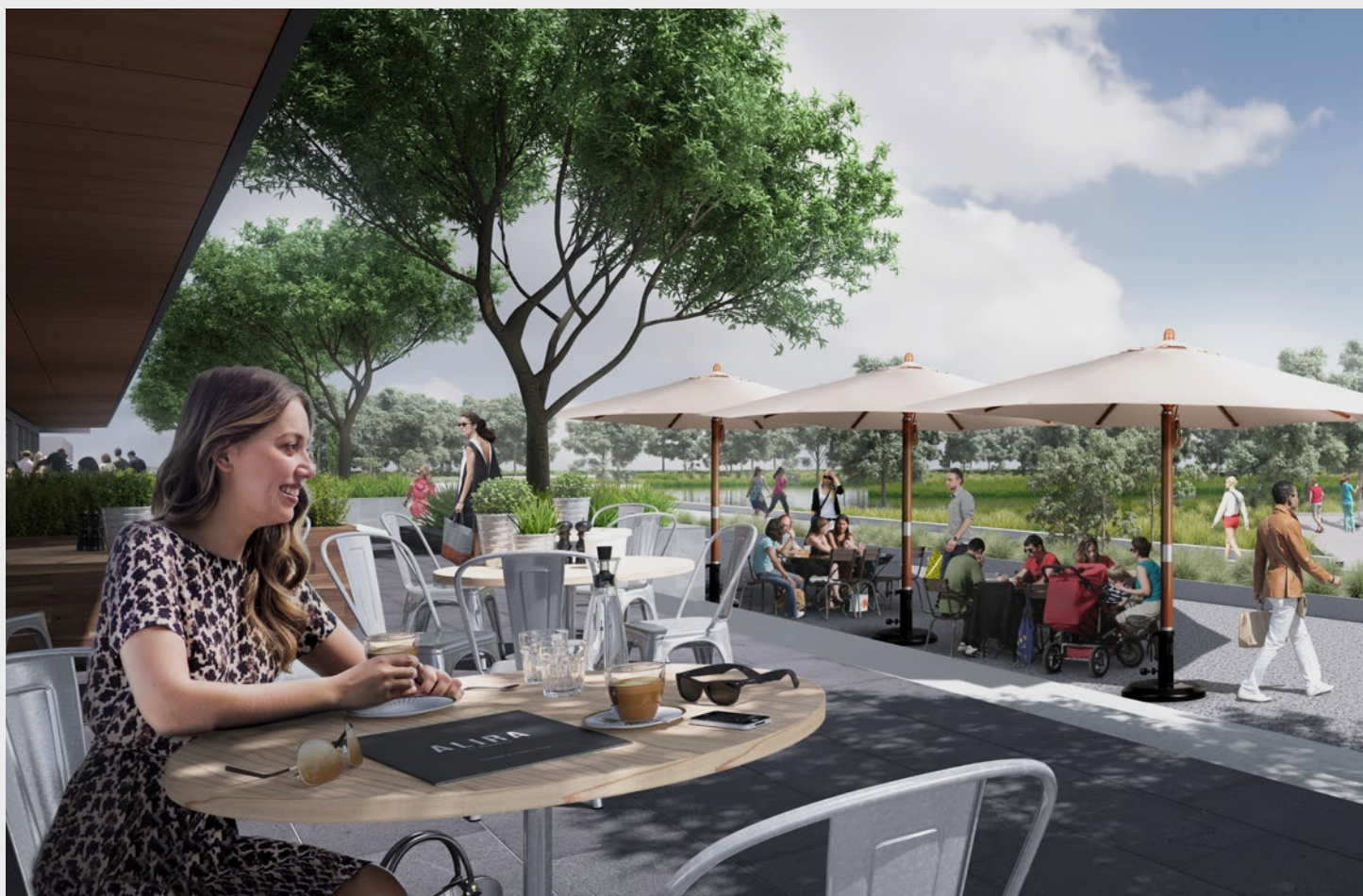
WOMAN ENJOYING A COFFEE NEXT TO THE SHARED WETLANDS. ARTIST'S IMPRESSION.

Held every Sunday, the popular Akoonah Park Market provides residents with a great range of product, plants, crafts, clothing and gifts. A perfect way to start a Sunday morning! Entry is free.