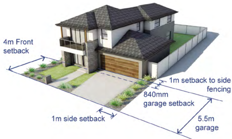
DIAGRAM 01: Setbacks Standard Lot