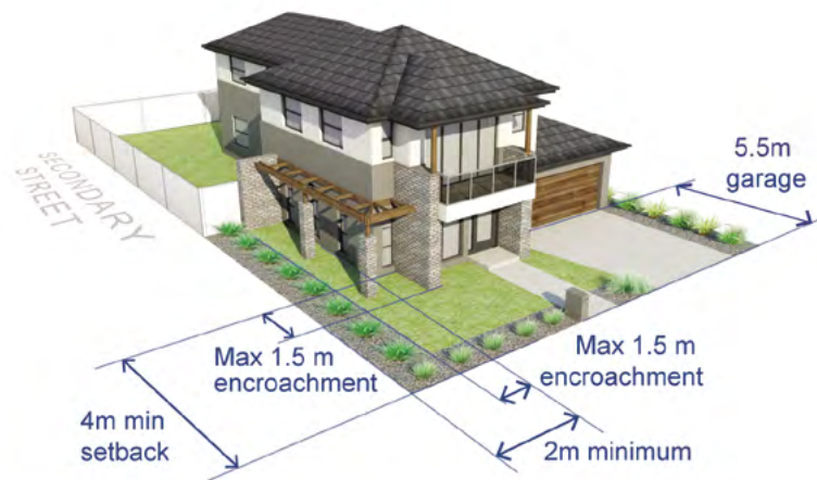
DIAGRAM 02: Setbacks Corner Lot