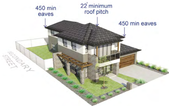
DIAGRAM 03: Roof design