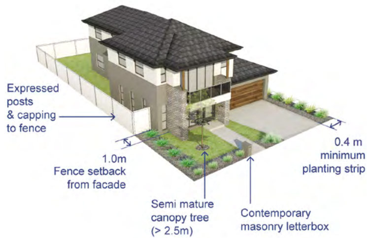
DIAGRAM 06: Fencing