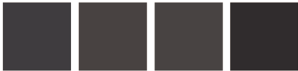
DIAGRAM 05: Colour Palettes